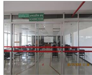
Photo of the inside of the main production hall Training room.jpg