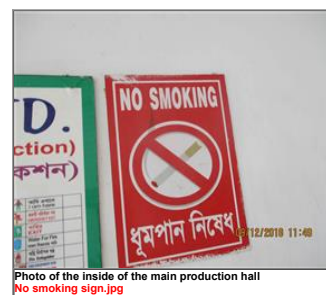
Photo of the inside of the main production hall No smoking sign.jpg