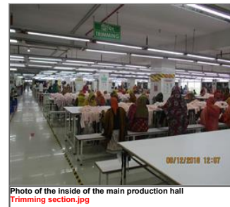
Photo of the inside of the main production hall Trimming section.jpg