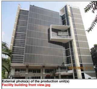
External photo(s) of the production unit(s) Facility building front view.jpg