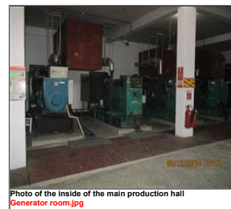
Photo of the inside of the main production hall Generator room.jpg