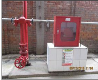
Photo of fire safety equipment Fire hose pipe.jpg