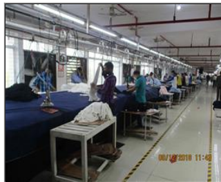
Photo of the inside of the main production hall Pressing section.jpg