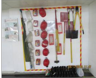
Photo of fire safety equipment Fire fighting equipment.jpg