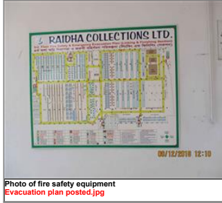
Photo of fire safety equipment Evacuation plan posted.jpg