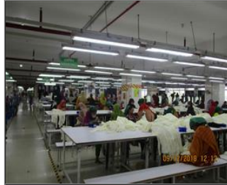
Photo of the inside of the main production hall Mending section.jpg