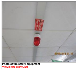
Photo of fire safety equipment Visual fire alarm.jpg