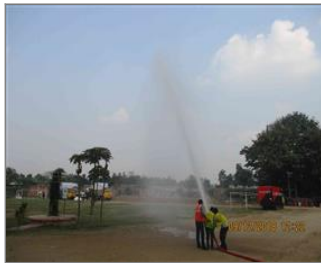
Photo of fire safety equipment Fire hose pressure check.jpg