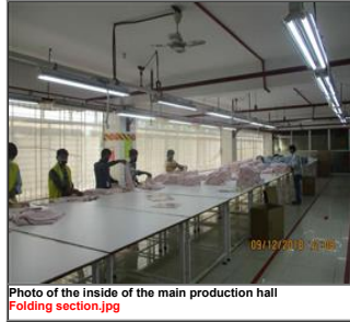
Photo of the inside of the main production hall Folding section.jpg