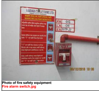
Photo of fire safety equipment Fire alarm switch.jpg