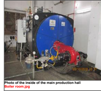
Photo of the inside of the main production hall Boiler room.jpg