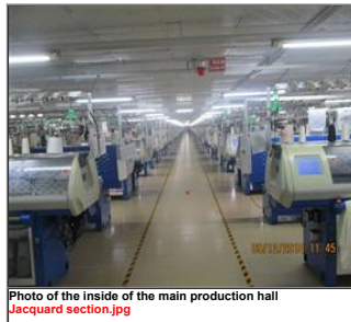
Photo of the inside of the main production hall Jacquard section.jpg