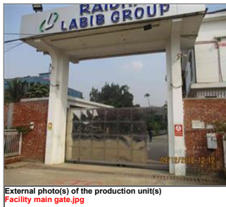
External photo(s) of the production unit(s) Facility main gate.jpg