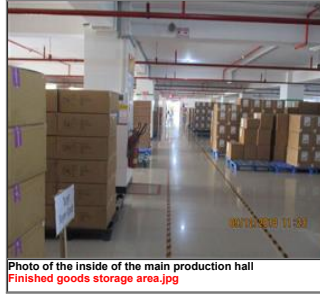
Photo of the inside of the main production hall Finished goods storage area.jpg