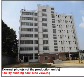
External photo(s) of the production unit(s) Facility building back side view.jpg