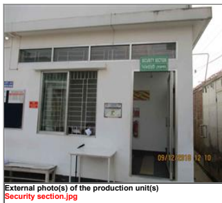
External photo(s) of the production unit(s) Security section.jpg