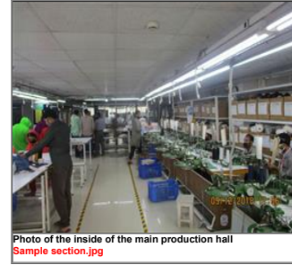
Photo of the inside of the main production hall Sample section.jpg