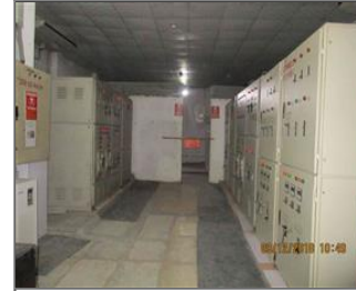
Photo of the inside of the main production hall Sub station room.jpg