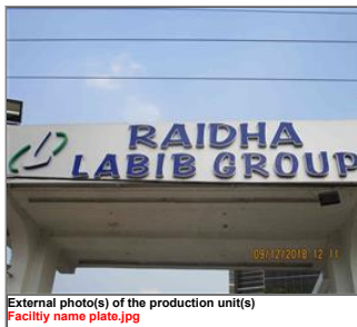
External photo(s) of the production unit(s) Facility name plate.jpg