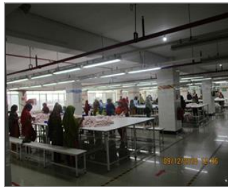
Photo of the inside of the main production hall POC (pre-quality check) section.jpg