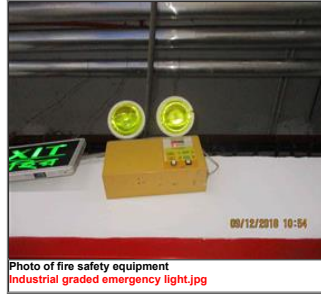
Photo of fire safety equipment Industrial graded emergency light.jpg