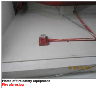
Photo of fire safety equipment Fire alarm.jpg