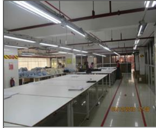
Photo of the inside of the main production hall Packing section.jpg