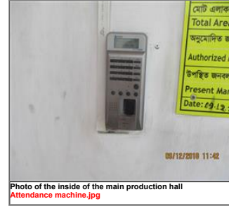
Photo of the inside of the main production hall Attendance machine.jpg