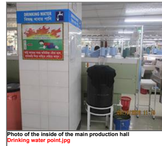
Photo of the inside of the main production hall Drinking water point.jpg