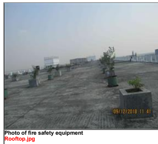
Photo of fire safety equipment Rooftop.jpg