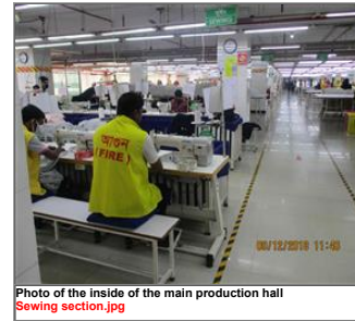
Photo of the inside of the main production hall Sewing section.jpg