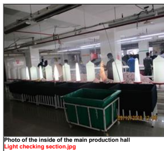
Photo of the inside of the main production hall Light checking section.jpg