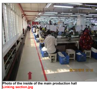
Photo of the inside of the main production hall Linking section.jpg