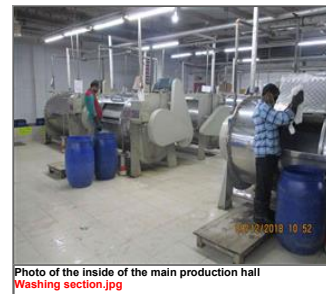
Photo of the inside of the main production hall Washing section.jpg