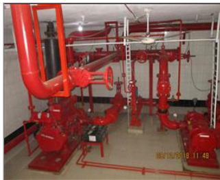
Photo of fire safety equipment Fire pump room.jpg