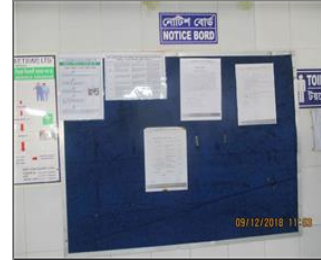
Photo of the inside of the main production hall Notice board.jpg