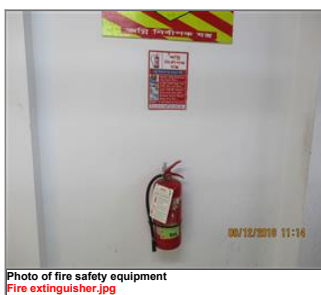
Photo of fire safety equipment Fire extinguisher.jpg