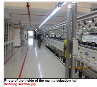
Photo of the inside of the main production hall Winding section.jpg