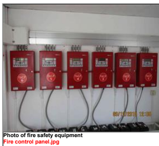
Photo of fire safety equipment Fire control panel.jpg